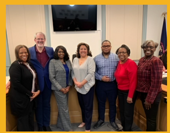
Albion City Council

On behalf of the City of Albion, welcome to Albion. We're so glad that you are here! We love Albion and hope you will too.